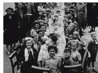
A Street Party in 1945 to celebrate VE Day, the end of World War II

Friday 8th May 2020 is a Bank Holiday in the UK to remember and celebrate the end of World War II for Europe in 1945. People in Europe waited a long time for the fighting and bombings to end and celebrated with street parties enjoyed by all.