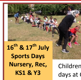
16 th & 17 th July Sports Days Nursery, Rec, KS1 & Y3