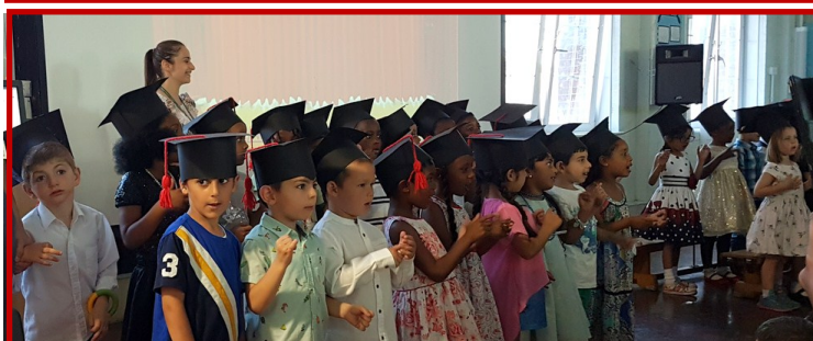
18 th July 2018 Reception Graduation

It is sad to say goodbye to our Year 6 pupils but we are sure they will take many precious memories away with them. Their show 'The Lion King' was a stunning performance and we saw again, just how talented our children are!